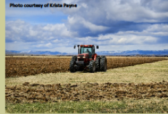
Farming, ranching, and recreation are important to the economy of Rich County. The county ranks in the top five Utah counties for beef cows.